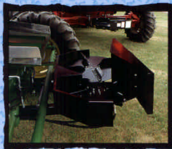
Single and Tilting Double Disc CYCLONES are available for all major combine models.

eliminating uneven soil drying and staggered wet strips. CYCLONE also reduces interference with chemicals caused by wet and heavy windrows.